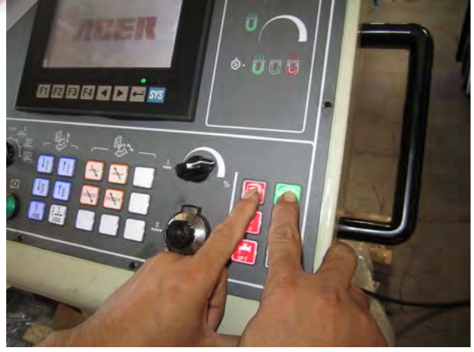
Fig.3 Push On and Off immediately. Make sure spindle rotation is clockwise.