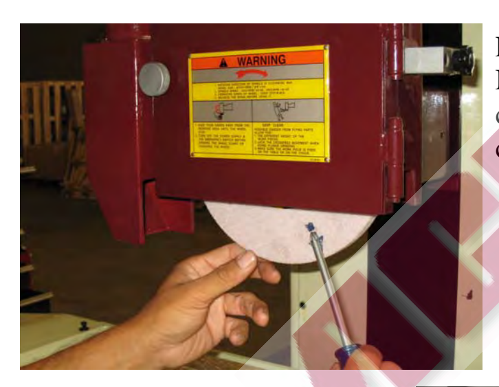
Fig 2. Tap wheel with an object. Make sure the wheel is not cracked. The sound should be clear and consistent.