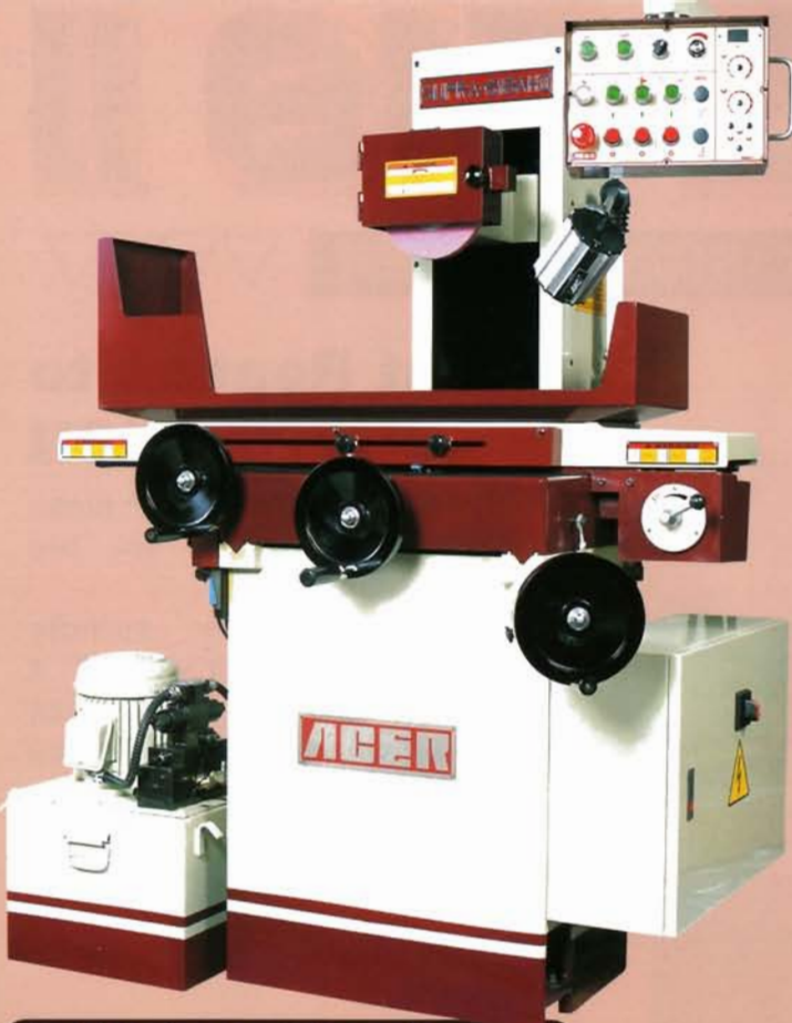
SUPRA 618 II AH