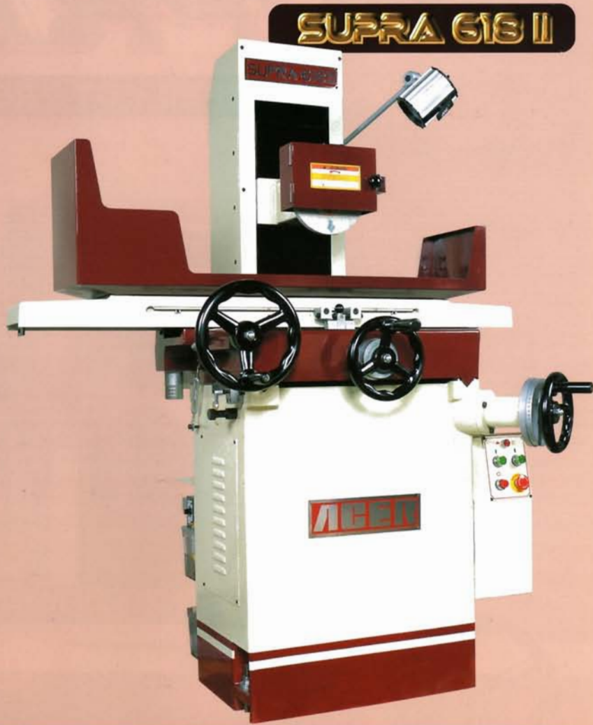
SUPRA 618 II